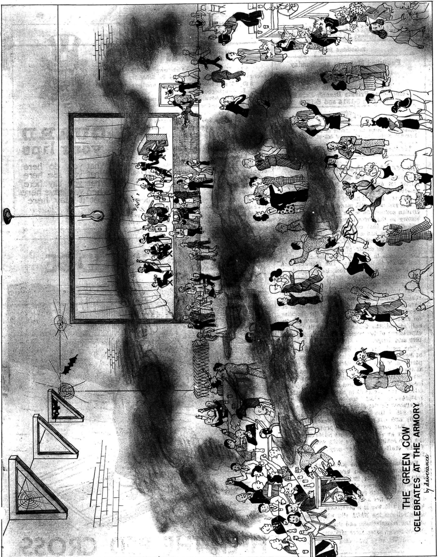
THE GREEN COW CELEBRATES AT THE ARMORY