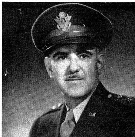
Brigadier-General F. O. Carroll

plasma and surgical dressings supplied by the Red Cross frequently mean the difference between life and death to a wounded soldier. And the millions of of Prisoner of War packages sent by the Red Cross to our men in enemy hands are the only guarantee we have that they will return to us in good health when the war is over.'