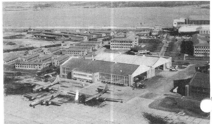
belonged to the Army. The up-to-date picture on the right shows the vast contrast and the great changes that have taken place within the past 23 years.