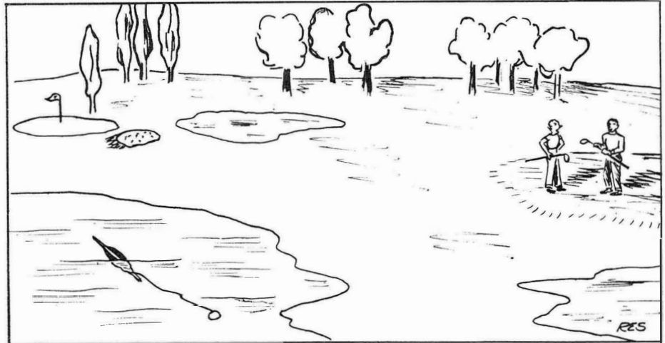
Of course, I don't hit a long ball. but I haven't lost one yet!