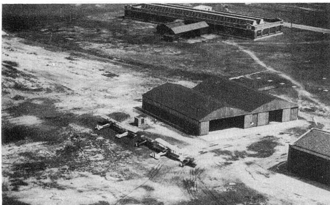
Shown above on the left is a picture taken of the NACA Hangar and airplanes back in March, 1924. The building shown in the background was not a part of the NACA but