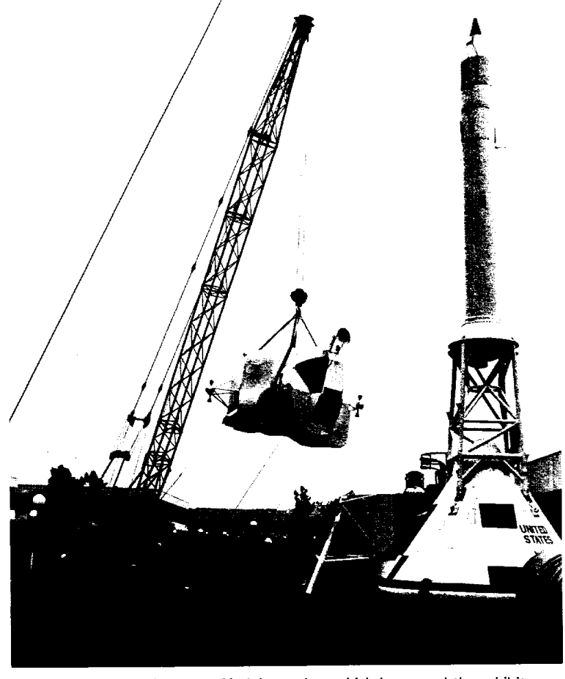
LM REMOVED - The Lunar Module mockup which has graced the exhibit area near Building 2 since 1967 recently was disassembled and carried away from the Center. The years and "rough weather" finally took their toll on the module, but fond memories attached to it will live on.

Want to rent car top luggage carrier, must be 3 ft wide by 4 ft long, zip canvas cover to fit 73 Chevelle sta wgn, June 28-July 13, Brenton, 2634.