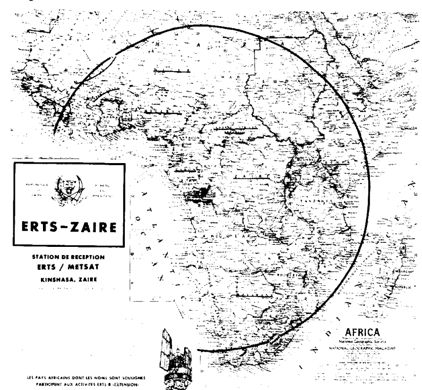
GROUND STATION - This photograph shows the coverage which the Zaire ground station will have when it becomes operational. Within the circle, the ground station will be able to receive data from either LANDSAT I or II.