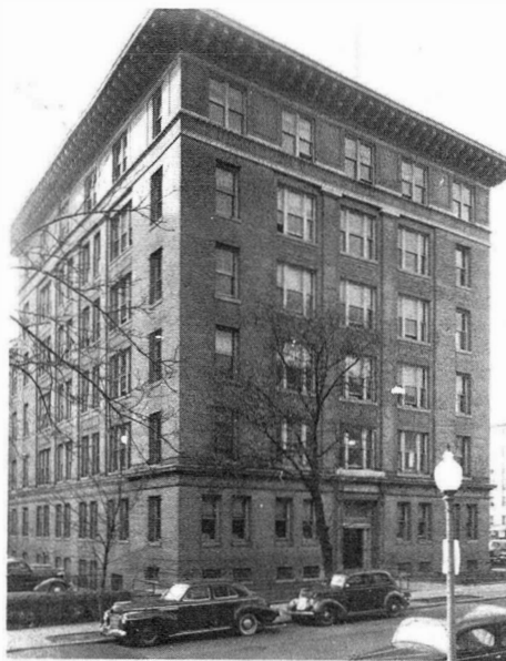
Shown above is the building at 1724 F Street, Washington, D. C., which is now occupied by the NACA Washington Office.