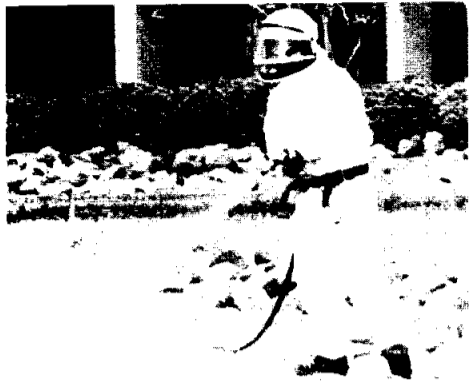
ALIEN ENCOUNTER? — An apparent extraterrestrial operates a mean-looking forceweapon against unseen resistance. Or could it be...? See page 2 for alien's identity.

If Skylab attitude control can be regained by MCC, it is estimated that orbital lifetime of the space station can be extended by as much as six to 12 months—assuming attitude maneuvers are successful and the gyros keep on spinning. By placing Skylab in a local horizontal attitude, the spacecraft's reentry into the atmosphere can be delayed until sometime between late 1979 and mid-1980.