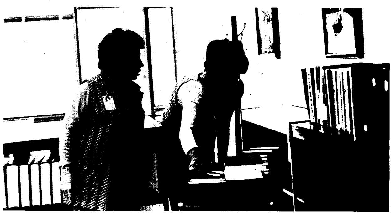
SHELVING TIME-Library workers are shown in the process of shelving books that have been utilized by employees

The initial cost-plus-fixed-fee/ award contract was awarded for a one year period, and the new extension runs through February 12, 1976 for an estimated annual contract value of $6.7 million. Pan Am employs about 320 people in the operation of all JSC utility systems and facility maintenance, buildings, roads, addition to the title. The motto ditches and special equipment.