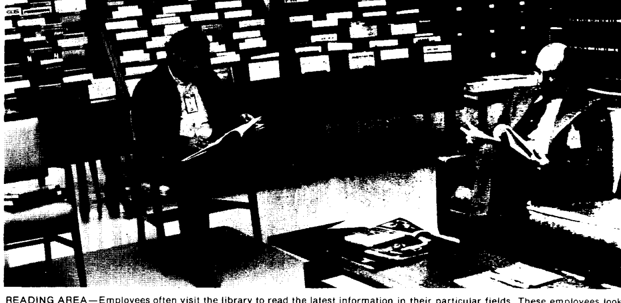
READING AREA—Employees often visit the library to read the latest information in their particular fields. These employees look through some of the many journals in the library

Several years ago, the library While most of the information began using an information retrieval system called RECON which links by leased telephone