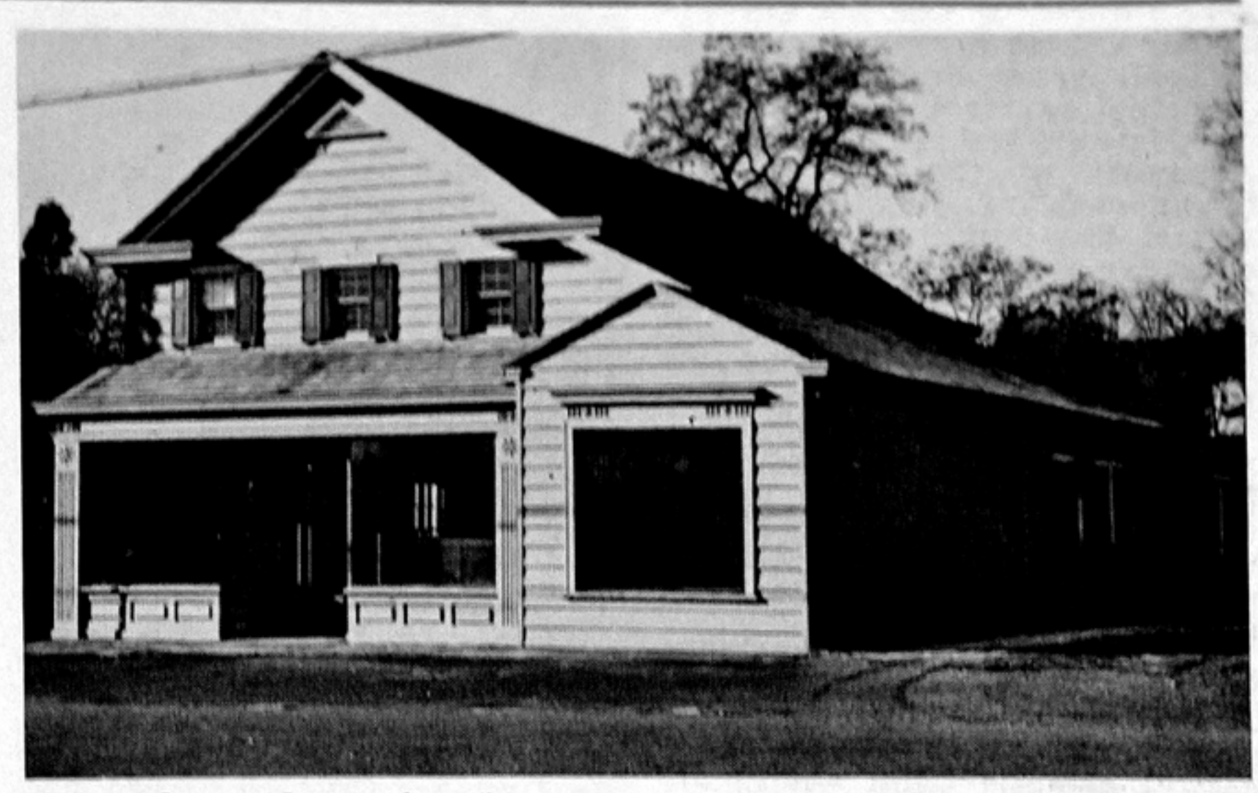
A new home for the growing Personnel Department

A G B A BOOK B B COM PARTICIPATION & THE RESIDENCE OF STREET