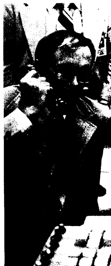
Harlan during Skylab reentry

Following the year of training and evaluation at JSC, successful candidates will become astronauts available for Shuttle flight crew selection.