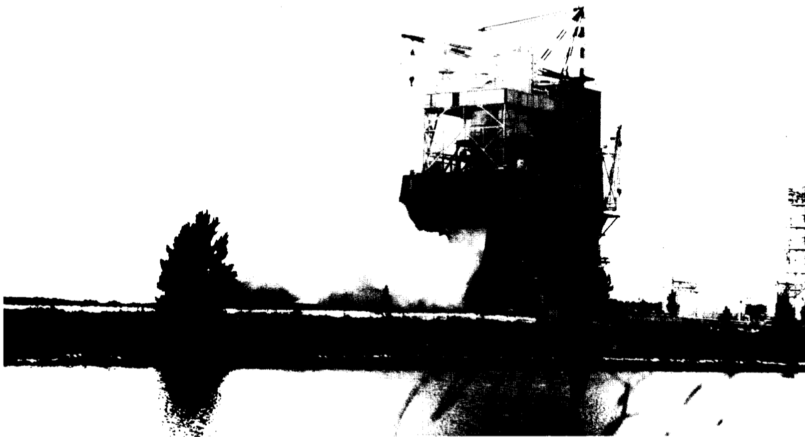
A successful test-firing of Columbia flight engines at NSTL last month