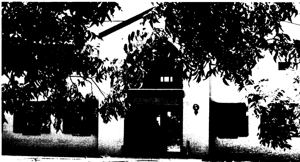
McGETCHIN HALL, at the Lunar Planetary Institute, will house a DECAVAX 11-780 computer for a Lab for Analysis of Planetary Surfaces (LAPS), one of seven NASA imagery cen-

X. Uphold these principles, ever conscious that public office is a public trust.