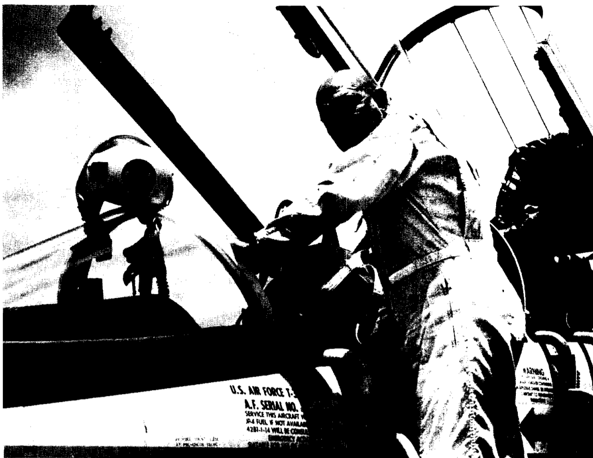
'His favorite is the T-38, training plane of the astronauts.'

Flying is still exciting to him though; some weeks he may fly up to 30 hours. While he flies the C-130, KC-135, 747 Shuttle Carrier Aircraft, and the Gulfstream Executive Jet, his favorite is the T-38, the training plane of the astronauts.