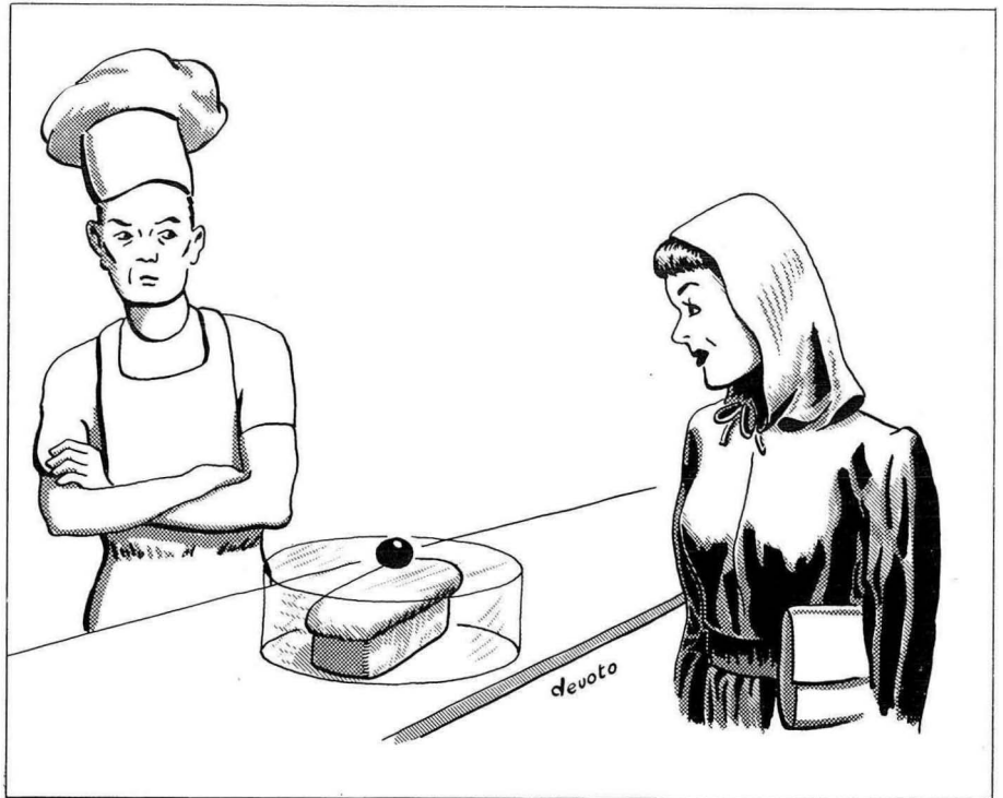
"Yes, I know - but how much is it a slice?"