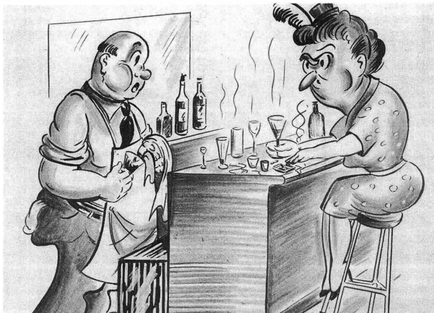
"I always have lemon in my drink. Understand, Sour-Puss?"