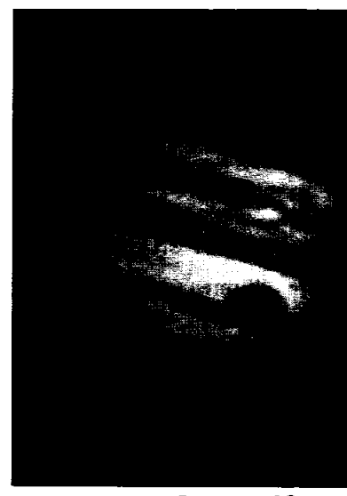
Jupiter by Pioneer 10

Consider these factors. Our neighboring worlds of the solar system are undisturbed models of