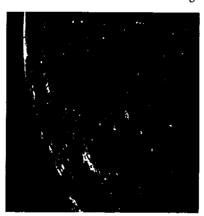
Mercury by Mariner 10

netic poles have a tendency to wander. In fact, every 10,000 years or so they actually reverse positions. Based on an average spacing of these polar swaps, we are due for the next reversal any time now. Little is known about the causes of this phenomena or its effect on our environment, which could be considerable. Hopefully, spacecraft data on the magnetic fields of Mer-