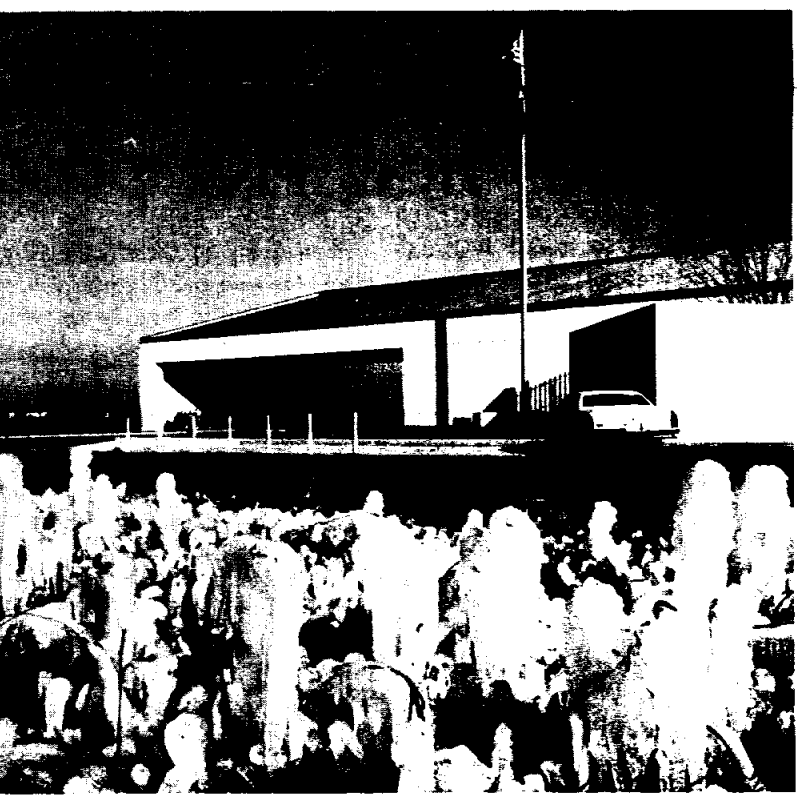
ICE SCULPTURE - These frozen forms appeared overnight recently outside the

mentation of an ASTP rescue capa- from official meeting minutes. bility which allowed reconfigurainoperative.